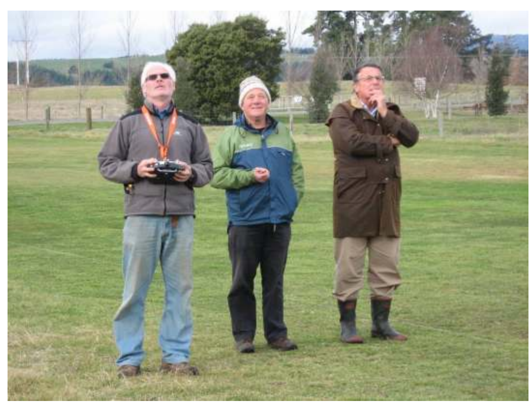
Event 129 R/C Glider Thermal B