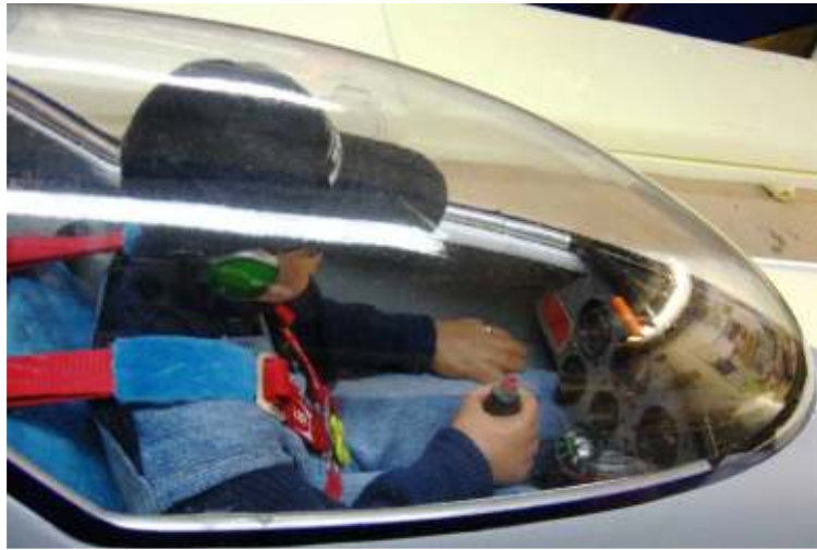
Canopy locked and ready to go.