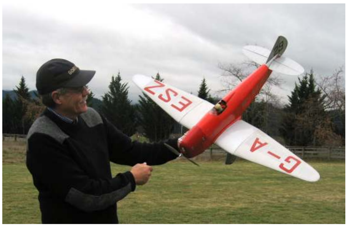
Chilton from 1949 Aeromodeller plan scaled to 42 inch span and powered by the ubiquitous Cox BabBee tuned and proped for long engine runs.

Pete and I went on to fly one of the new electric classes. ALES 123 this time. In this new event you climb to 123 metres (400 feet) when an altitude switch turns off your motor then you try to glide out to 6 minutes and land spot on time and in a landing circle. I used my cheap and cheerful 2 m Apex and Pete had his beautiful moulded Graphite. Both models flew similarly and struggled to make time early on before that Ara lift appeared. Pete won this one with better times and landings. Well done mate.